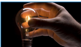
Reduced megawatt output